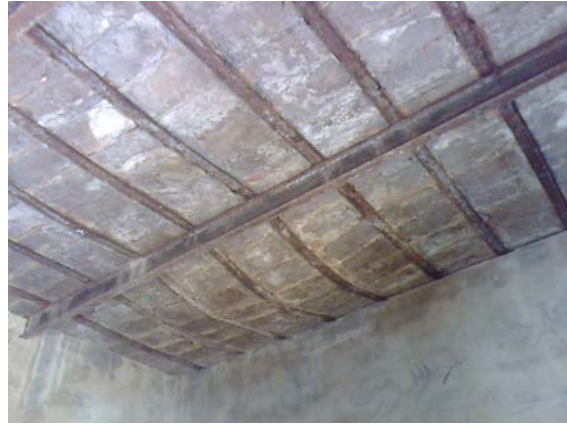
view of School Roof

Due to hiring of staff this school facilitates the children's of 4 villages of the surrounding village Dodo Khan Mari.