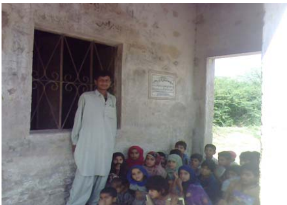
View of student with teacher

The Government Primary School Dodo Khan Mari is located in Deh: 105 UC Tulaka Ali Mari. This school was closed from the year 1997 due to non-availability of teachers. In Sindh Devolved Social Services Program 2004-05, the District Government Mirpurkhas had to take the initiatives of hiring teachers for 200 schools of the district. As per this program, one teacher was hired for Govt. Primary School Dodo Khan Mari on 17-1-2007 and the school was reopened which had an enrolment of about 66 students (48 boys and 18 girls). All the students are studying in class-1.