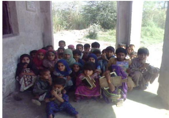
view of students