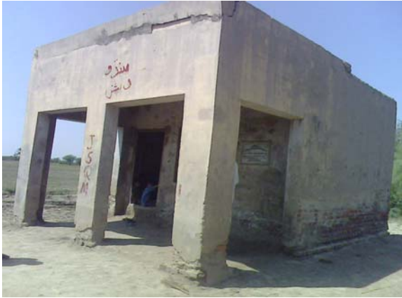
View of one room school building

One room building was constructed in 1990-91, inaugurated by Haji Ghulam Rasool Junejo Chairmen District Council Mirpurkhas but furniture is not received from Education department up to date and building condition is very poor.